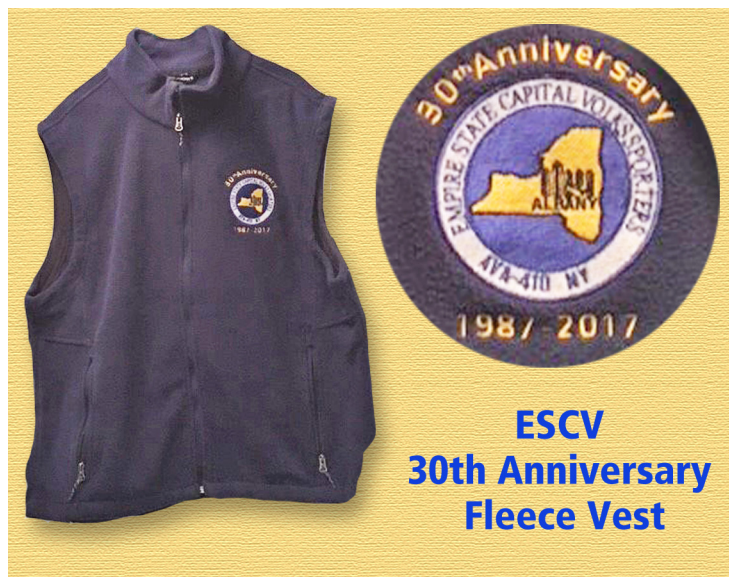
ESCV 30th Anniversary Fleece Vest

DEADLINE is DECEMBER 2 the day of the Holiday Luncheon. (It is the last Traditional Walk that is available to stamp your incentive)