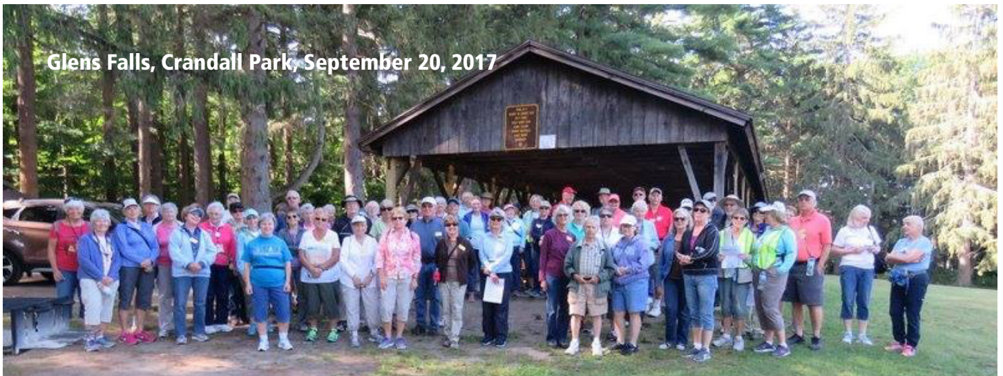
Glens Falls, Crandall Park, September 20, 2017