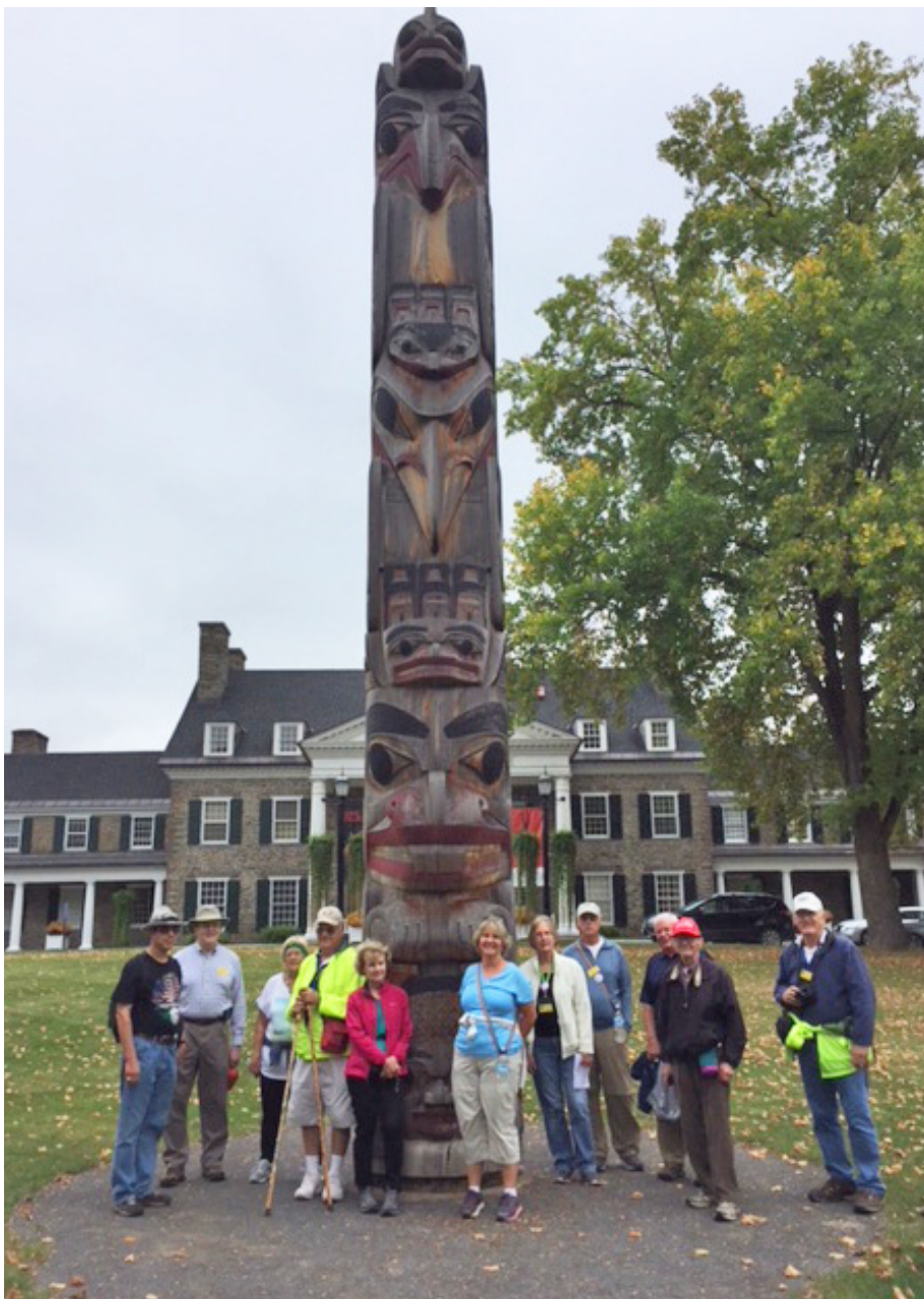
10K Walkers — Cooperstown, September 30, 2017