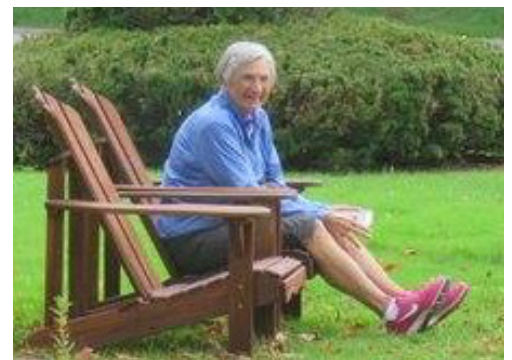
Williamstown, September 29, 2017