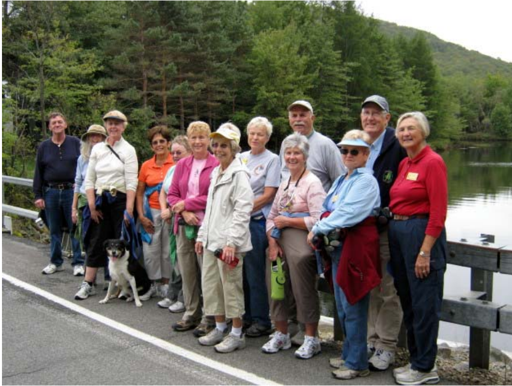
Caroga Lake Walkers, Saturday, September 12 th , 2009