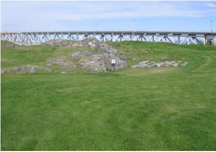
Ft. St Frederic