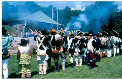
Re-enactment in 1996

More information contact Charlotte, P O Box 907, Middlebury Vermont 05753 at 802 462-2019 or cpwalkvt@shoreham.net .