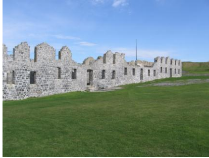
His Majesty's Fort of Crown Point