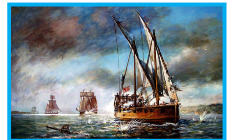
Painting by Ernie Haas depicting the Congress escaping at the Battle of Valcour Island.